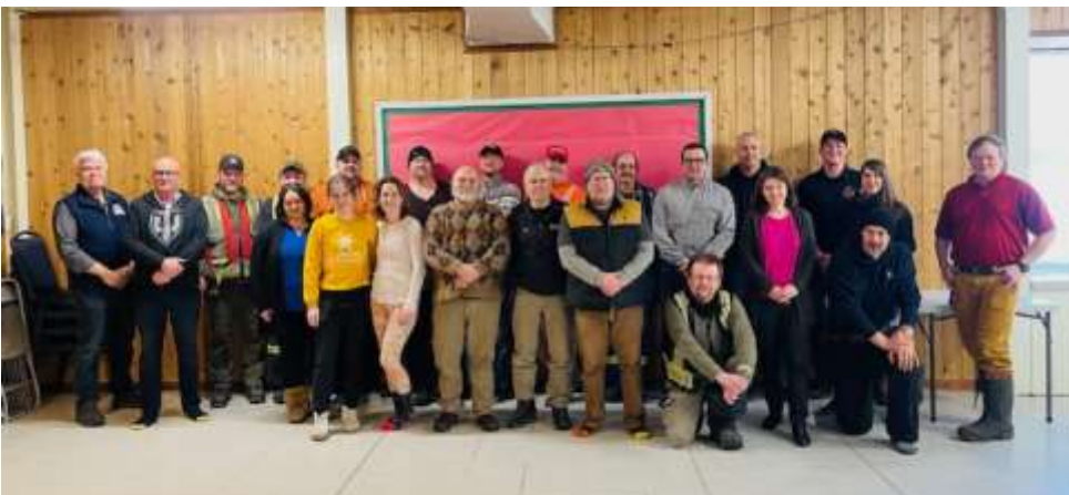
Focused on Faro

Again, the Town of Faro thanks everyone who was able to attend the Community Emergency Management Plan tabletop exercise.