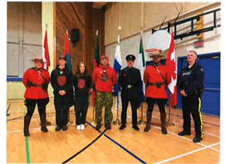
The Faro and Ross River Detachment of the Royal Canadian Mounted Police, Faro Canadian Ranger Patrol and Faro Junior Canadian Rangers.